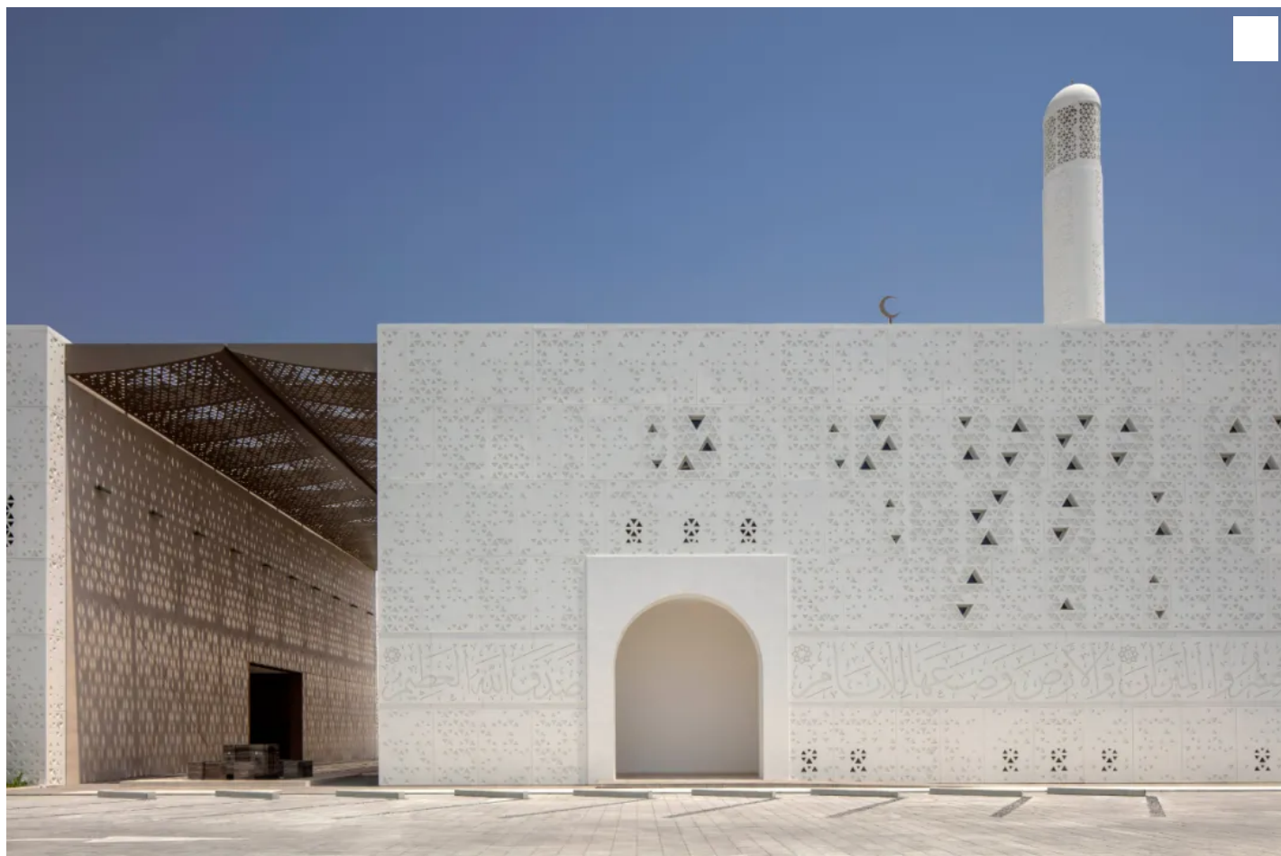
加尔加什清真寺北立面 North elevation

更多详情，点击图片 Click the above picture for more information