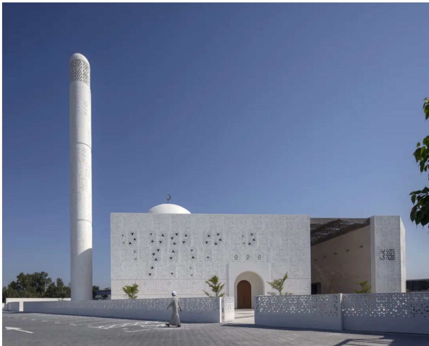
加尔加什清真寺南立面 South elevation