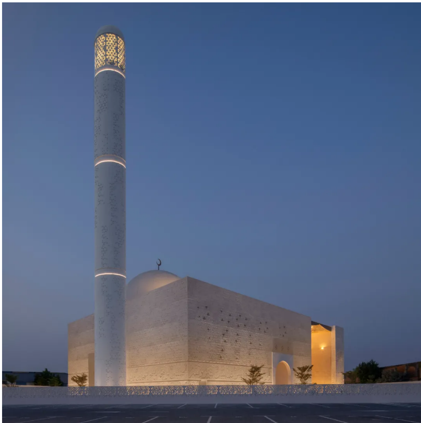
夜景外部照明细节 External lighting detail of night view